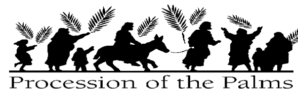
Procession of the Palms

The Ministry of Membership invites everyone to come and join them on Easter Sunday Morning, April 12 th , for breakfast in the Fellowship Hall. The menu will be Breakfast Casserole, Fresh Fruit, Hot Chocolate and Coffee. Breakfast will be served from 8:45 – 10:00 PM.